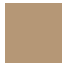
A-58 Swiss Coffee