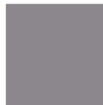
A-57 Platinum Gray